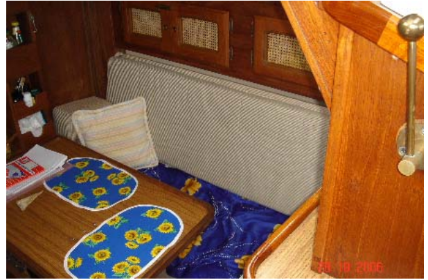
Saloon - Stb