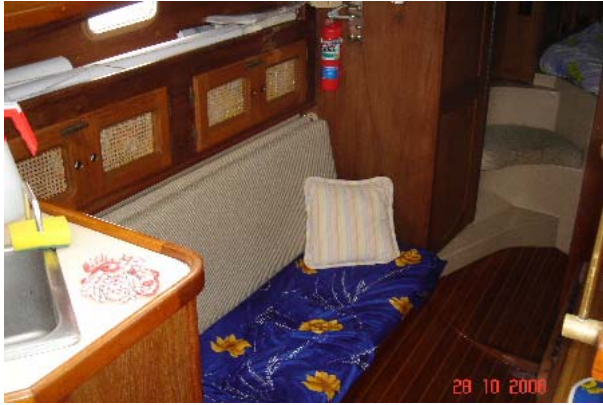
Saloon - Port