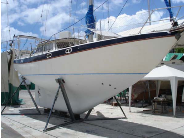
On the Hard