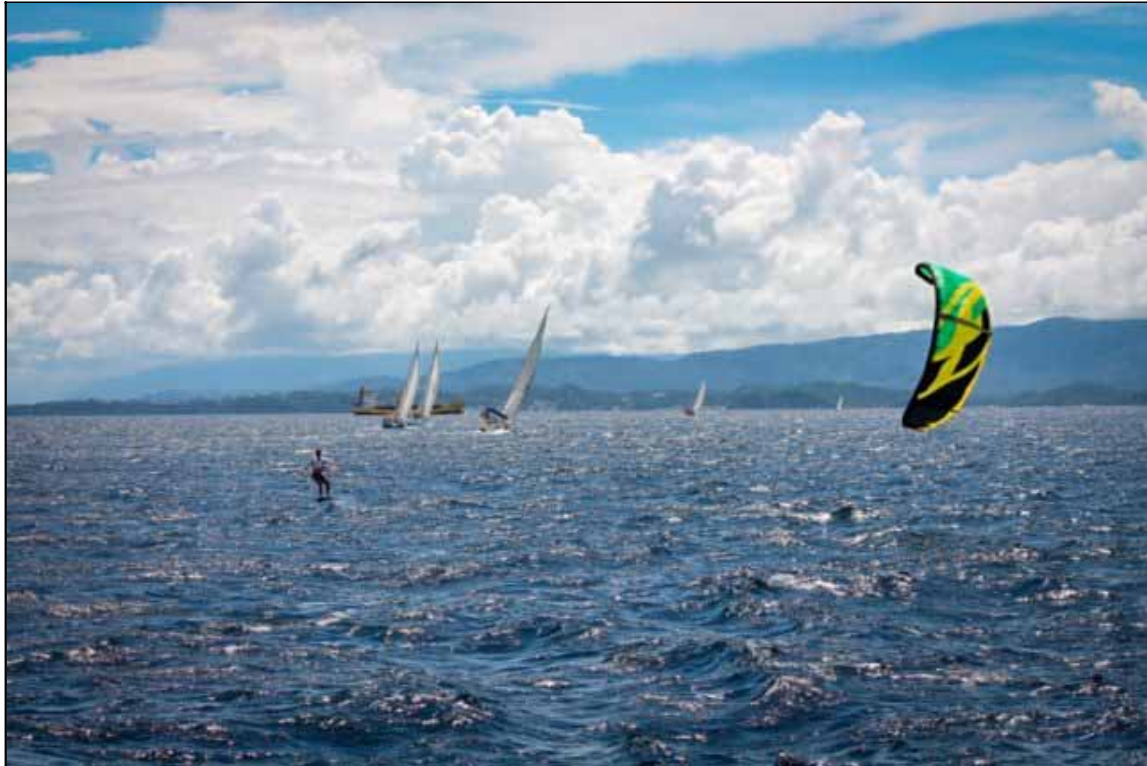
Kite-Foil sole participant in 2017 ASR : Kareem Magill