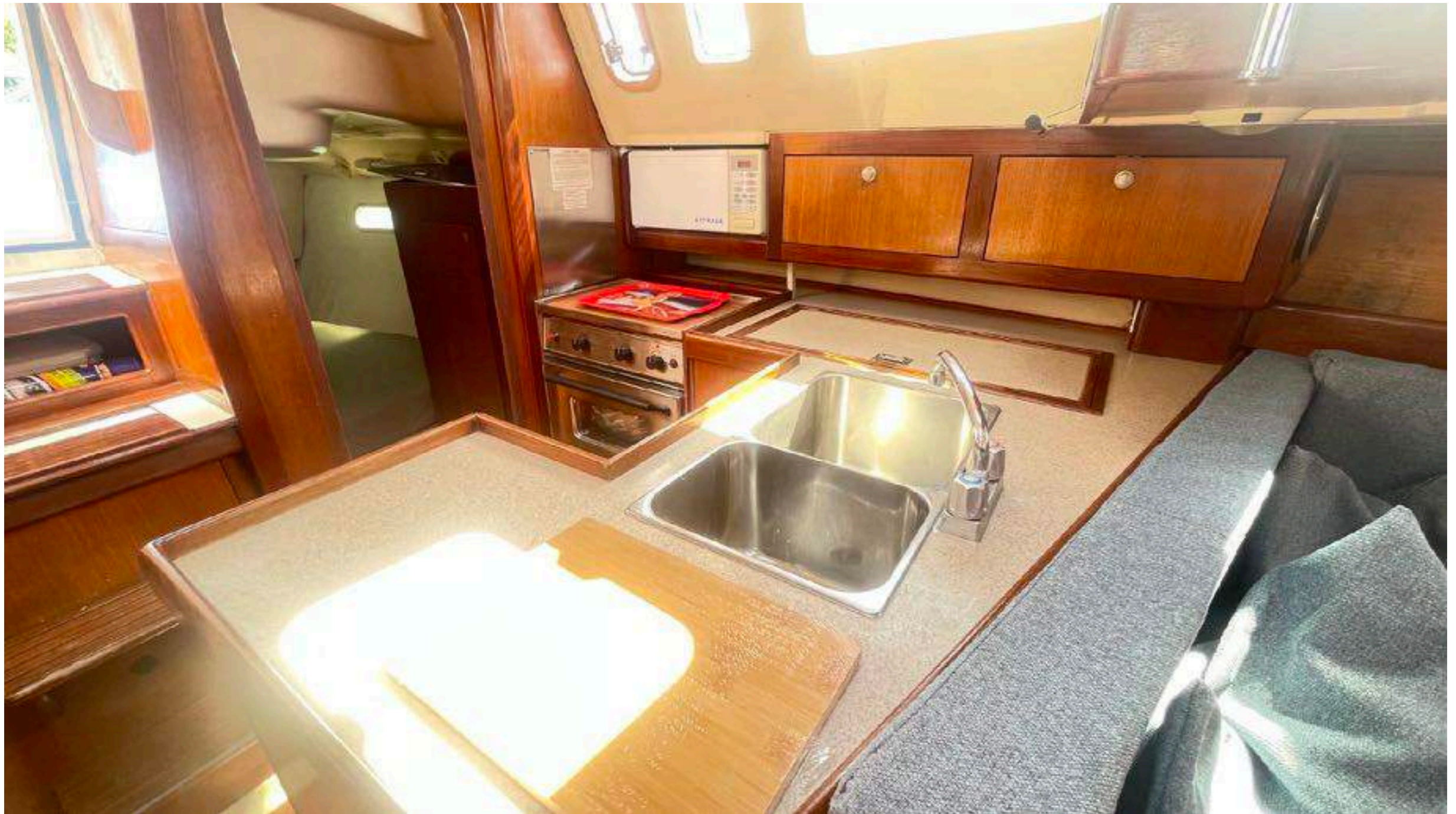
Fully equipped kitchen ( all new dishes, cutleries, pans and pots etc) Gas stove and 220V microwave.