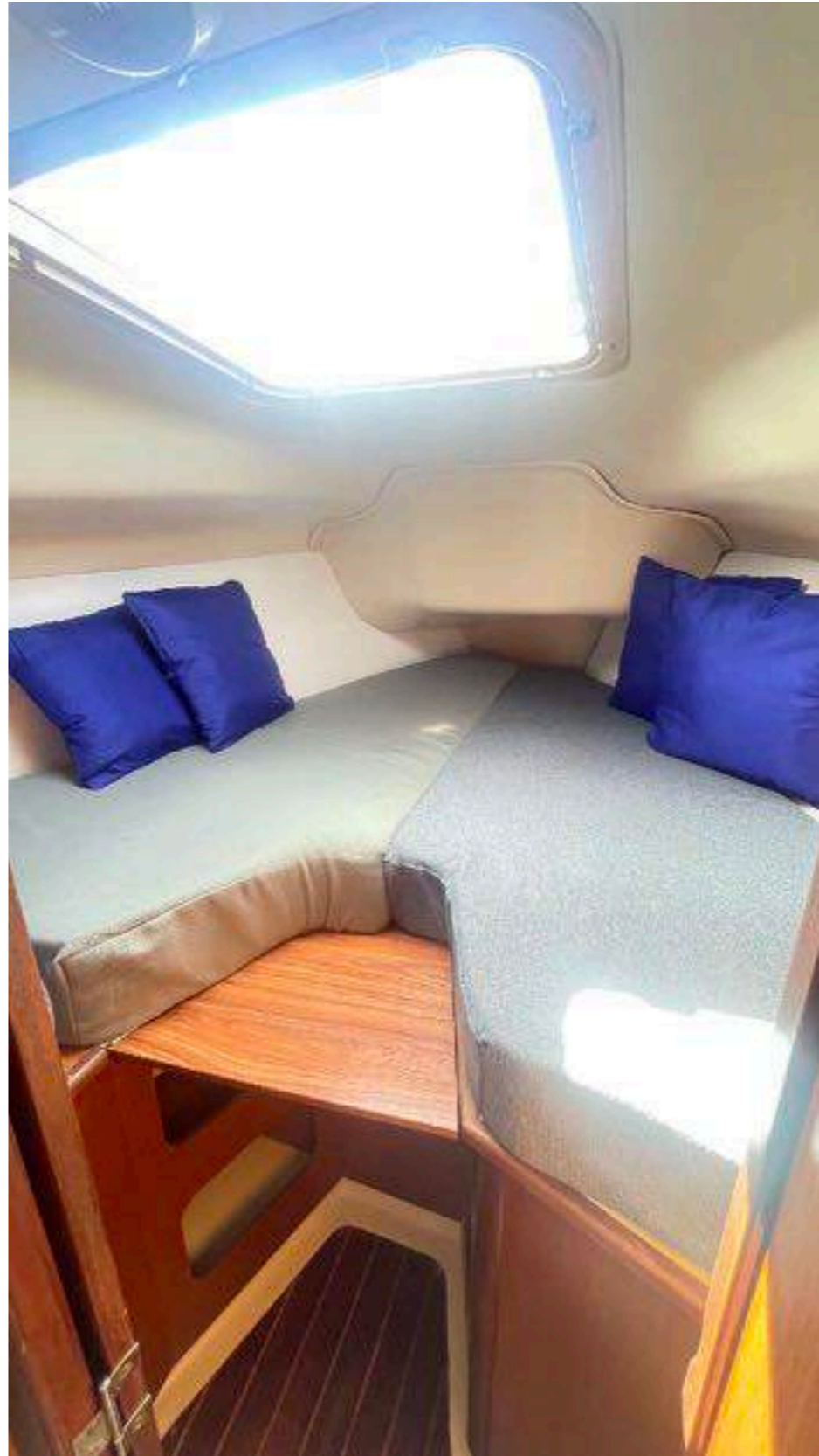
New beds (Uratex) in both cabins.